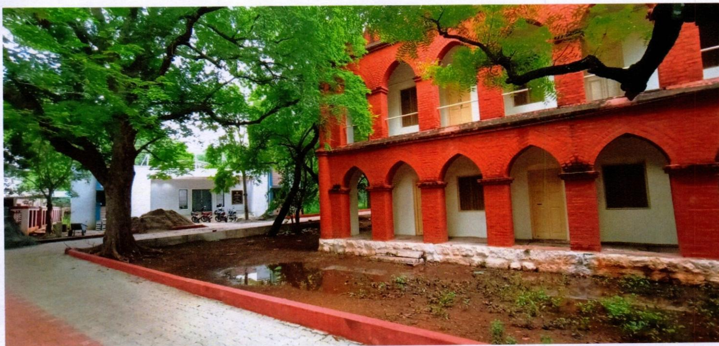
Proximity of Noyes Garden (Extension of Women's Hall) – Washburn Hall